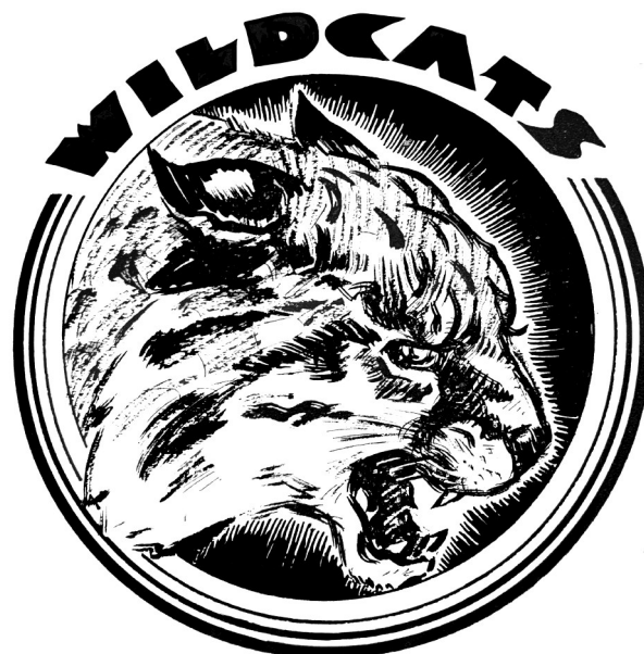
Above: The sketch of the Wildcat mascot first appeared in The BHS Key, the Burlington High School yearbook, in 1935.

“The Grasshopper” was also a name of the annual for Burlington High School from 1912 to at least 1916. Other names for the Burlington annuals were Forget-Me-Not, The Red