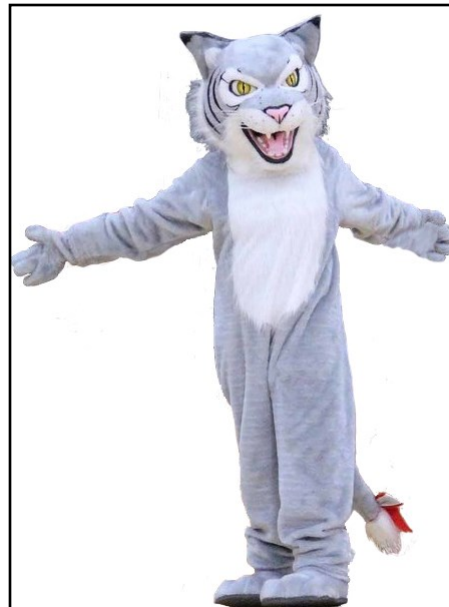
Top Right: The current Wildcat mascot. Photo from the USD 244 website from a 2019 basketball game.