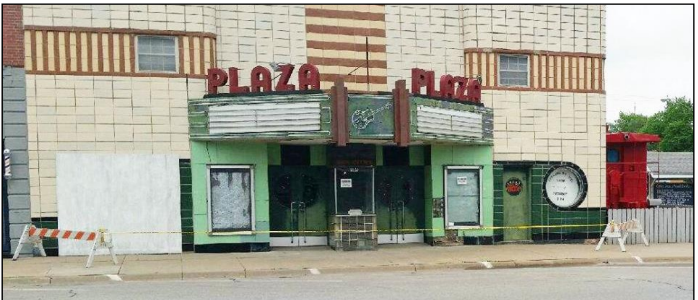
Above: The current condition of the Plaza theatre building. A barricade had been set up in the front of the building in case tiles fall off and a board covers up a hole in the building when a car drove through it on December 2, 2014.