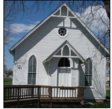
Above: Bethel Church Below: Rural Dale Schoolhouse