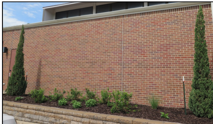
New landscaping on the east side of the museum by the parking lot was done this Spring by Strawder's & Daughters.