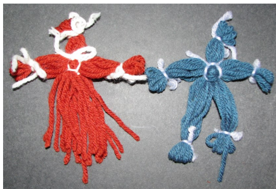
Yarn dolls is just one of the many activities that will be offered during Pioneer Days.

The museum is looking for volunteers to lead the different activities. If you are interested in volunteering, please contact the museum by email erin@coffeymuseum.org or by phone (888) 877-2653.