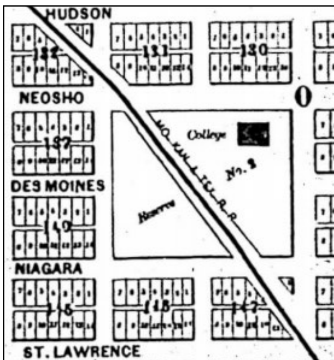
Above: 1885 map of Burlington showing where the college was located in Reserve No. 2, where the museum is located today.

During the June 3, 1885 Burlington City Council meeting, a petition was presented for a $10,000 bond to aid in the erection and completion of Kansas College