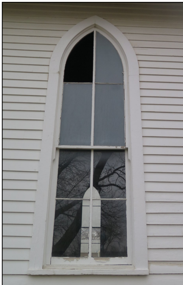
Above: Part of a window broken in the Bethel Church this spring will be repaired along with the interior of the church and the school house.

We are still adding Coffey County Veterans to our display in the Flint Hills Gallery at the museum. A binder was also created with the veteran's photograph and information. This binder is currently located in the Flint Hills Gallery.