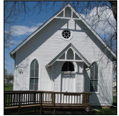
Above: Bethel Church Below: Rural Dale Schoolhouse