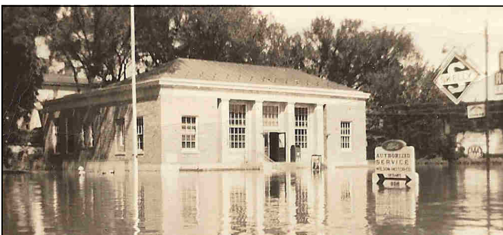
Top: The Burlington Post Office after it was built in 1941.