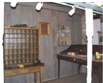
The Post Office Display.