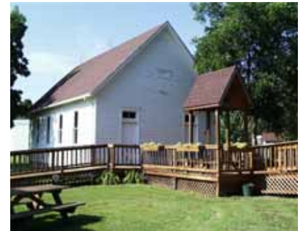
The boardwalk in front of the school.

The finished product is beautiful and the wood should be preserved for many years to come. The past years of snow, ice, water, and other elements made the wood dull and brown and molded in some areas. Now the board walk looks like brand new wood ready for visitors to enjoy the school, church, gazebo, bell tower, and playground equipment!