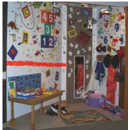
The new hands-on Children's Room.