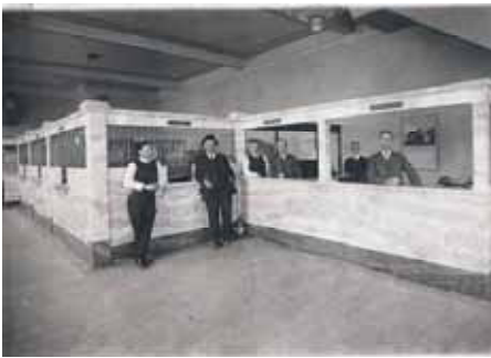
People's National Bank in 1916.

There are more displays that we have planned for the next year in order to bring out artifacts that have been in storage for a while and to give some that are on display now a much needed rest. Come in periodically and see all the wonderful history we have collected from Coffey County!