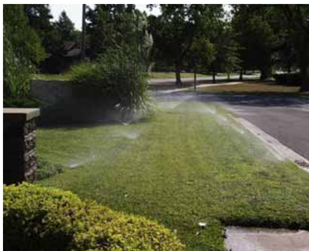
With the excessive heat our sprinklers have been working overtime!