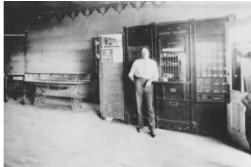
Strawn Post Office in 1930.