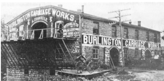
Burlington Carriage Works.