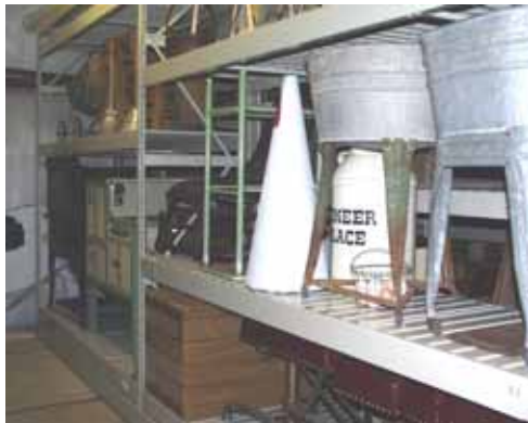
Artifacts after being organized on the shelves.