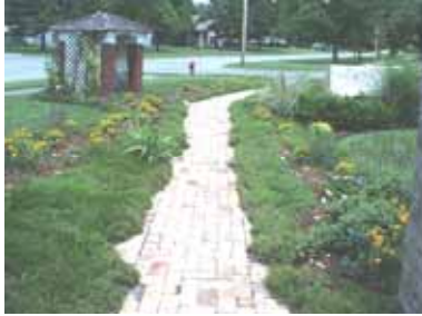
Flowers out front and the repaired gazebo.

In April, Kristin and Shirley planted new flowers in the entryway, along the boardwalk, and in the flowerbeds out front. In the front they planted rose moss and melanpodium showstar. Geraniums and sweet potato vines were planted in the flower boxes along the boardwalk.