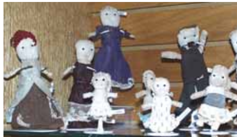
Other half of the Puffer doll collection.