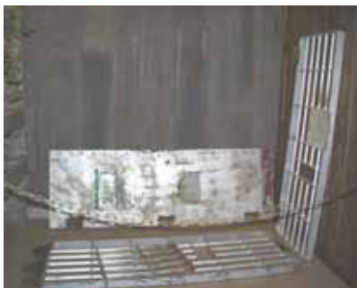
Three doors that were once at the Coffey County Jail.