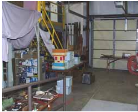
The back room after being cleaned.