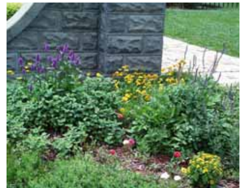
Flowers out front.