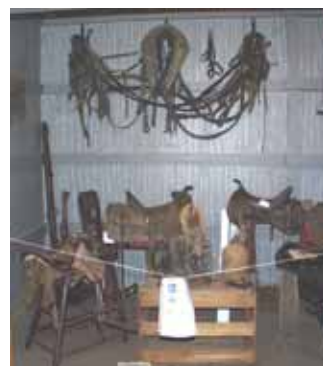
The livery display under construction.

There are different kinds of liveries, one is the full livery where the horses are managed, exercised, and sometimes even trained by