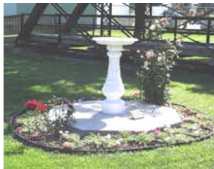
Roses next to the birdbath.