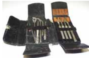
Endotracheal kit used to perform emergency tracheotomies.

Another interesting artifact in the back room is an endotracheal kit, which is also from the collection of Dr. A.B. McConnell. It was used in performing emergency tracheotomies.