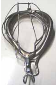
Ether mask used by Dr. McConnell

ether would be used instead. Today safer, less volatile anesthetics are used instead of ether. However, ether can be used to remove ticks from humans and animals. It is also used in the production of freebase cocaine.