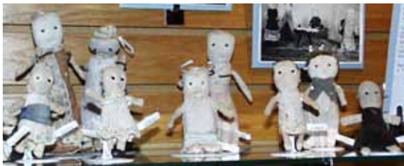
Puffer family doll collection.