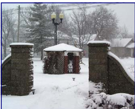
Looking out the front door of the Museum