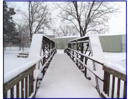
The Steel Bridge