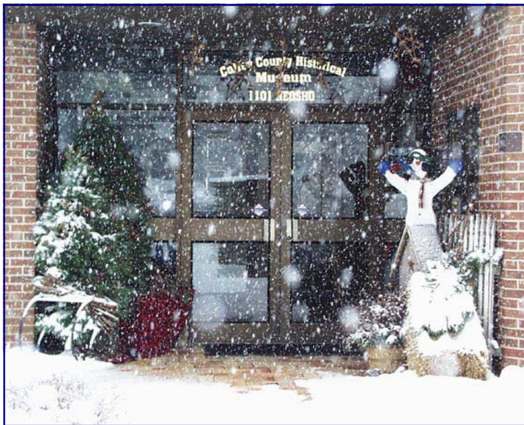
Huge flakes mask the entrance to the Museum