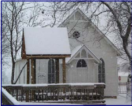
The Bethel Church