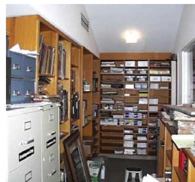
Long view of Paper Archives

using our genealogy library and telling their friends of our resources. Luck of the Irish to ya!