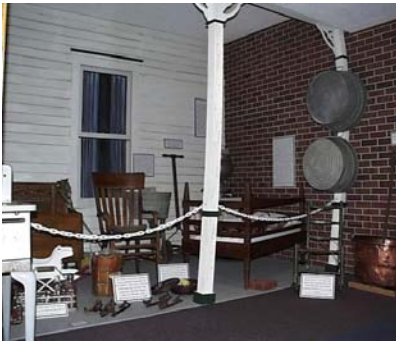
The new signage is visible in the picture of the “back porch” scene located in the Cochran Gallery.