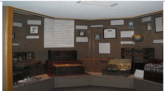
A peek at the trunk display. The information and signs are almost as interesting as the trunks themselves.

the trunks on display has paper covering on the inside lid, a fashion that came about during the mid 1800's. Also, an old WWII trunk is on display with the soldiers belongings still inside. Vintage photographs and naturalization papers of early day Coffey Countians are also on display to show what these trunks might have carried at one time.