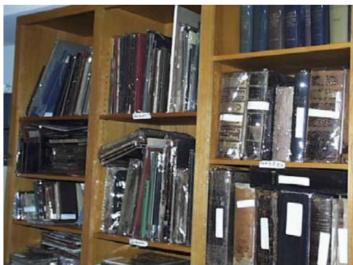
Wrapped books and papers to inhibit the toxins that are emitted.

to use our updated Microfilm and 1930 Census (Brand new to us).